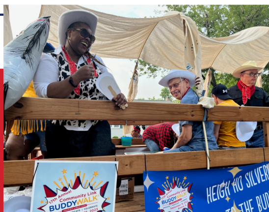
Community Link at the 2023 Clinton County Fair Parade